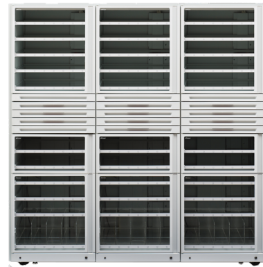
Three-Cell Auxiliary Cabinet