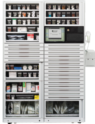
Two-Cell Cabinet Height: 77.5" Width: 51.5" Depth: 27.0"