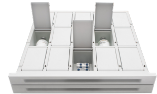
15-Bin Double-Deep Narrow

Bins: 5 Extended-Wide 5 Long Height: 1.7" Height: 1.7" Width: 6.6" Width: 13.8" Length: 3.4" Length: 3.4"