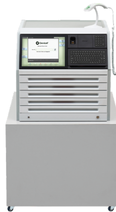
Quarter-Height Cabinet Height: 25.4" Width: 26.5" Depth: 27.0"