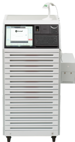
Half-Height Cabinet Height: 53.3" Width: 26.5" Depth: 27.0"