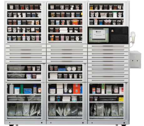
Three-Cell Cabinet Height: 77.5" Width: 76.5" Depth: 27.0"