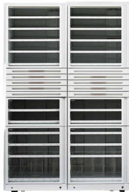
Two-Cell Auxiliary Cabinet