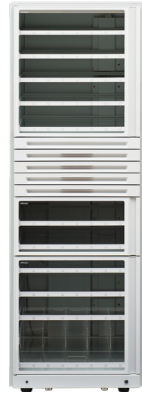
One-Cell Auxiliary Cabinet