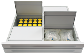
6-Bin Double-Deep Wide

Durable metal locking lids keep medications secure. All drawers include Guiding Lights.