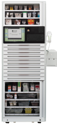
One-Cell Cabinet Height: 77.5" Width: 26.5" Depth: 27.0"