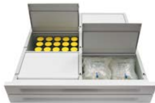
6-Bin Double-Deep Drawer