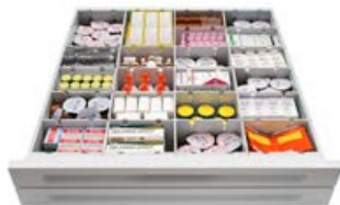
24-Bin Double-Deep Drawer